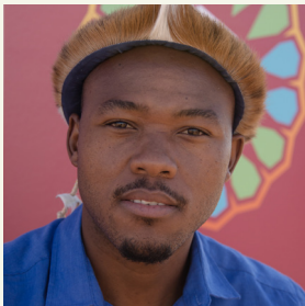
Khulekani Magwaza Evangelical Lutheran Church in South Africa. LWF Council member