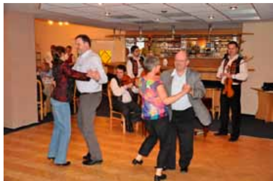
Leadership Consultation in Ostrava, cultural evening

“The biblical and theological focus of human beings created in the image of God ( Imago Dei ) ... challenges and inspires the European Churches