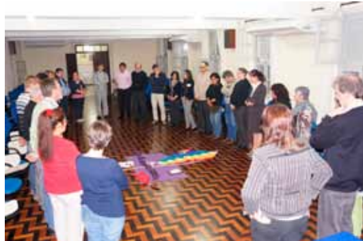
Leadership Consultation, Florianopolis, Brazil

Affirming the effective participation of women in LAC, the regional coordinator (WICAS), theo-