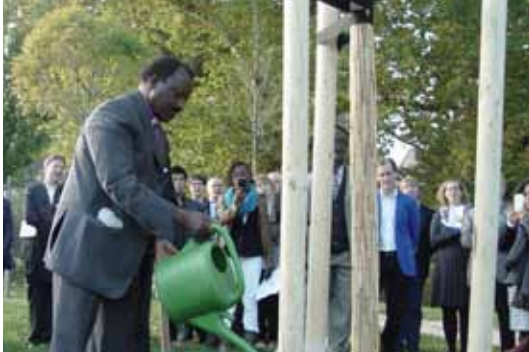
Treeplanting in Luthergarden, Wittenberg, Germany

to examine diakonia from a renewed perspective. How is the individual, the congregation and the Church called to care for the neighbor as a part of their very being? And how do the church and all its members act as servants and stewards of God's transformation in caring for the neighbor and all creation? We believe that diakonia within the LWF European regions should include the active role of coordinated advocacy on behalf of the neighbor around the world. We continue to feel ourselves committed to the gospel's preferential option for the poor. Therefore, we are committed through the ecumenical dimension of diakonia to empower the poor and advocate for fair economic standards and the cancellation of debt in Europe." The results from the discussions at the Ostrava Diakonia Day are being integrated into the outcome document of the Diaconal Process to be published in 2013.