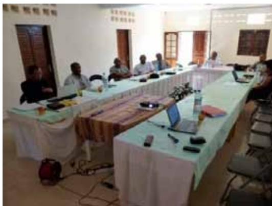
OD Team of the Malagasy Lutheran Church analysing organizational priorities

In 2012 two workshops were facilitated focusing on organizational development. Practical and documented experiences from another member