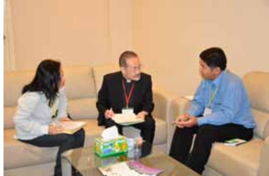
Pursuing an Asian Lutheran Identity

That same month, as part of accompaniment the LWF facilitated a leadership support meeting for the leadership of the Evangelical Lutheran Church in Congo (ELCCo) in Arusha Tanzania. This meeting was held under the leadership of the LWF-VP for Africa, LUCCEA, ELCT and LWF. In this meeting, an action plan was developed and agreed upon with steps for dealing with a long conflict in the ELCCo. The action plan mapped out new ways of accompanying the church more comprehensively due to its challenging environment. In achieving the above plan, the LWF-DMD is facilitating the process of Comprehensive Capacity Development (CCD) with the church to offer support in the following ways: a) having a better organizational structure, b) dealing with legal matters including reviewing of constitution, and c) dealing with conflict. The process will