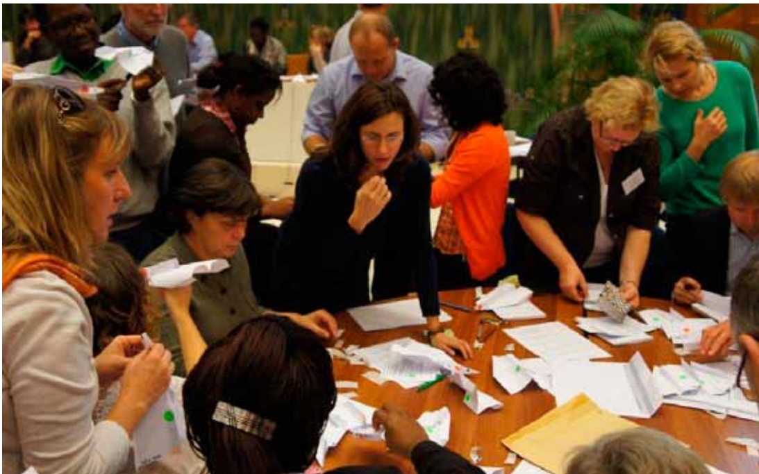
LWF Staff – Week of Meetings 2012