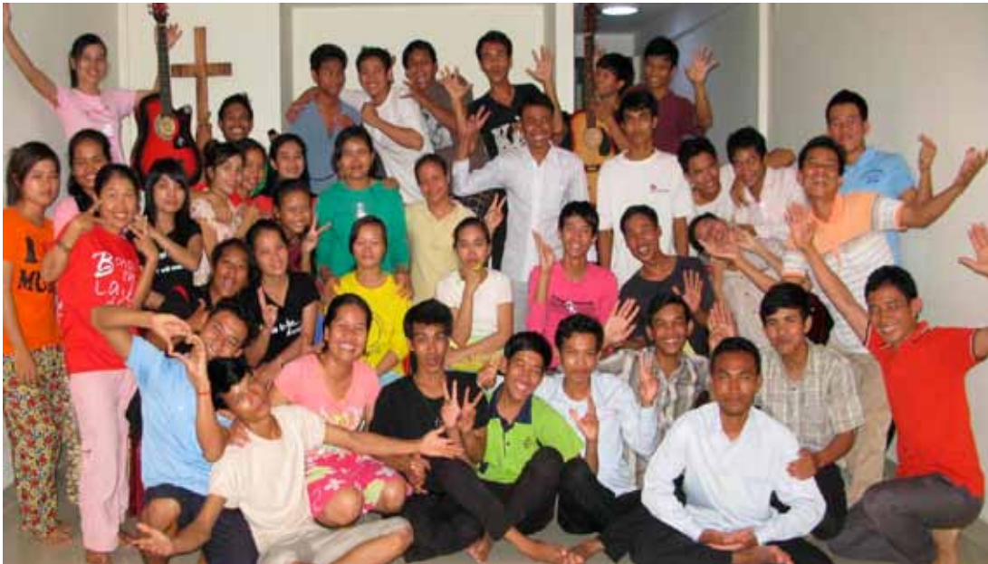
Training the youth of the LCC in Cambodia

ness and Liberation, Women and Youth Empowerment, Comprehensive Training and Health Services, Conflict Transformation and Peace Building, UELCI Communication project, UELCI HIV & AIDS program, UELCI Women project, Bangladesh : Indigenous Women Empowerment, Indonesia : Pelpem.