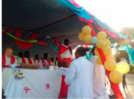
Returning trainees being ordained for service in the Lutheran church in Gambia

Participants expressed the need for strengthening the interconnection between church sustainability and human and institutional capacity development. Case presentations from selected