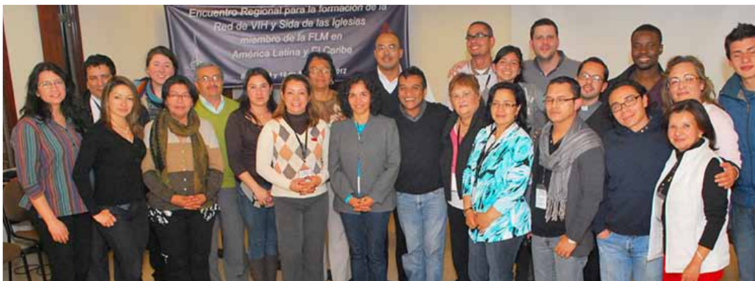
Meeting of the HIV and AIDS Network in Latin America and the Caribbean

logians, and young women gathered two days prior to the Leadership Conference. Seeking to build a platform, the women deepened their own reflection about women in leadership, in theological education and on their perspectives for the implementation of the LWF gender policy. As a result, the formation of the “ Women and Gender Justice Network ” with participation of women in pastoral ministry, theological formation, and young women will accompany a variety of processes on issues of women’s empowerment and also contribute to reflections on gender justice.