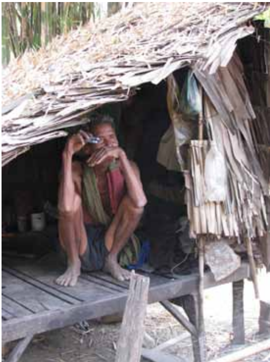
Accessing medicine