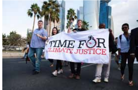
As the latest UN climate change negotiations continue in Doha, Lutheran youth joined with ecumenical partners to demand action at the COP18 climate summit.

The goal, “ Delegation members have understood the relevance of Climate Change in their local context and globally, ” was challenging since the young delegates were all quite new to the context of climate change and accompanied by three young leaders. This experiment however, turned out to create a dynamic, inspiring and active LWF delegation that had an impact on the COP18, the LWF Communion office, and in their churches. The young delegates, selected from nine LWF member churches, have actively participated in various events, including high-level segment panels, panel discussions, interfaith side-events and the first Qatari Climate demonstration. They