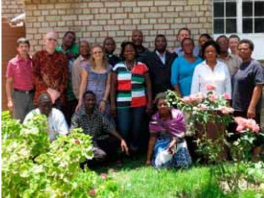
Participants at the Poverty Workshop with LUCSA-TARA, Windhoek, Namibia

In this seminar women were able to identify the following root causes of poverty in their context: political instability, conflict and war, corruption and misappropriation of funds, underutilization of natural and human resources, poor leadership and governance, poor policy, gender inequality and cultural practices, climate change, HIV and AIDS and other diseases, and low level of education and illiteracy. The women suggested projects for poverty reduction according to their local contexts and urged the churches to advocate for influencing policies in the governments that affect the marginalized and provide equal rights to access the resources for all.