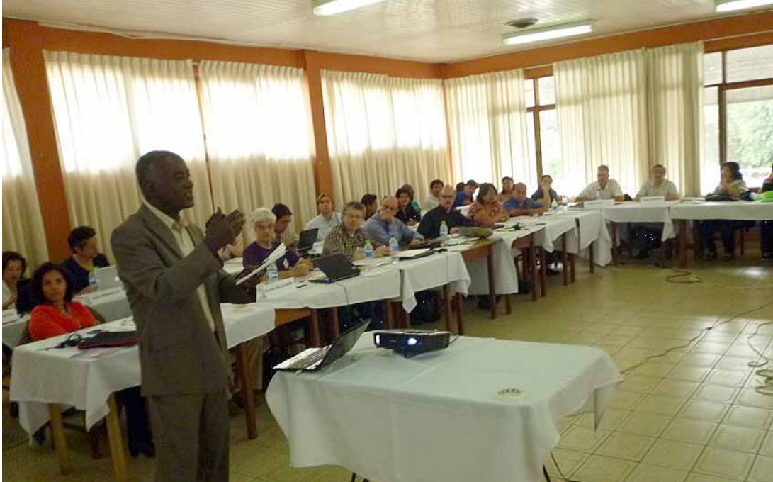
Partial view of the regional seminar (SLS/C) in Santa Cruz, Bolivia