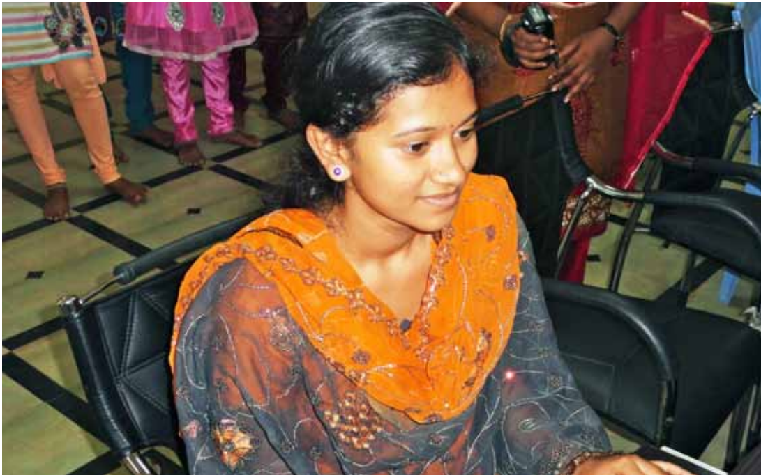
Learning computer skills to find a job and to better integrate in the society

In 2012 the LWF/DMD Project Implementation and Monitoring Desk (PIM) worked with 118 member church projects in 42 countries in all seven regions of the LWF. Compared to the year before, the number of projects is 20 projects less. The reduction has been intentional to provide