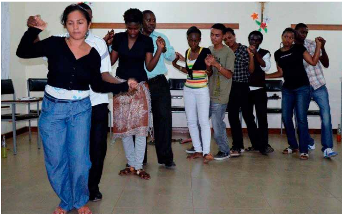
Participants at LUCCEA Youth workshop training on advocacy against poverty, 2012 in Arusha, Tanzania