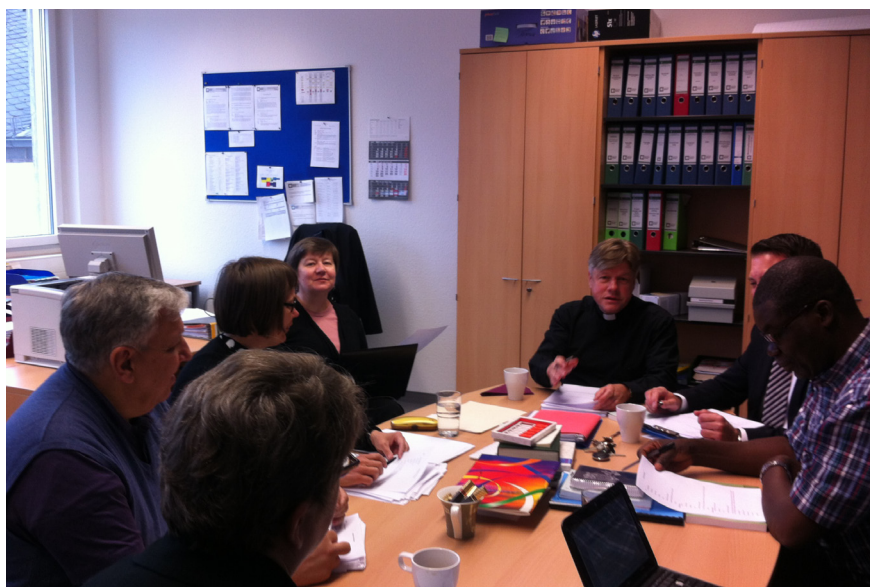
Members of the LWF-PCPCU liturgical working group at their first meeting in Würzburg, Germany.

http://www.lutheranworld.org/content/council-2013