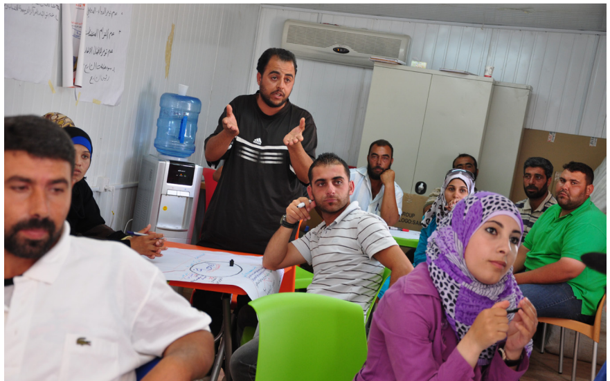
Syrian refugee community representatives participate in an LWF-led skills training session to mitigate and prevent conflict among families living at the Za’atri refugee camp.

Fatimah goes to a school run by the UN Children’s Fund, which is relatively