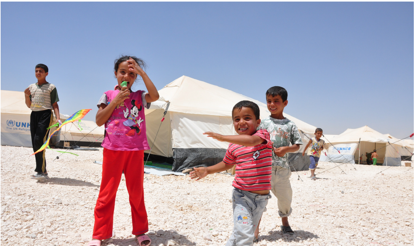
Children playing at the Za'atri refugee camp in Jordan