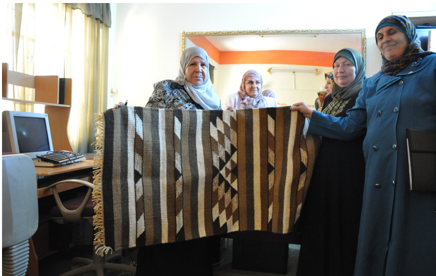
Members of an LWF partner organization display a carpet woven through a project supporting Jordanian host communities and Syrian refugees around Al Mafraq in northern Jordan.