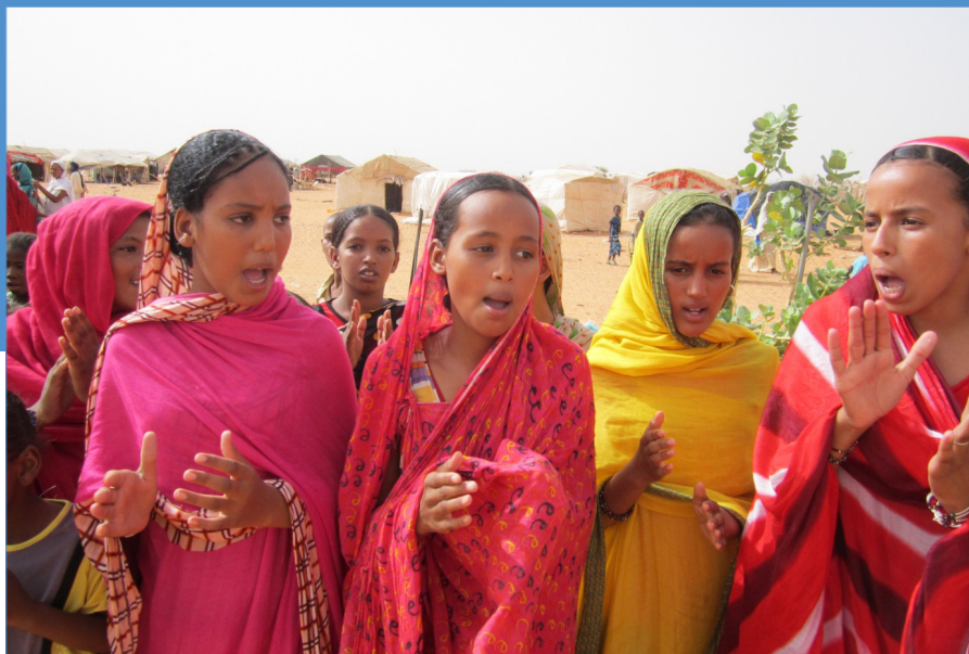
On 16 June, Day of the African Child, Malian girls cheer their football team at the LWF-run Mbéra refugee camp, southeast Mauritania.

Syria: Going Back Home Is Not Yet an Option ..... 11