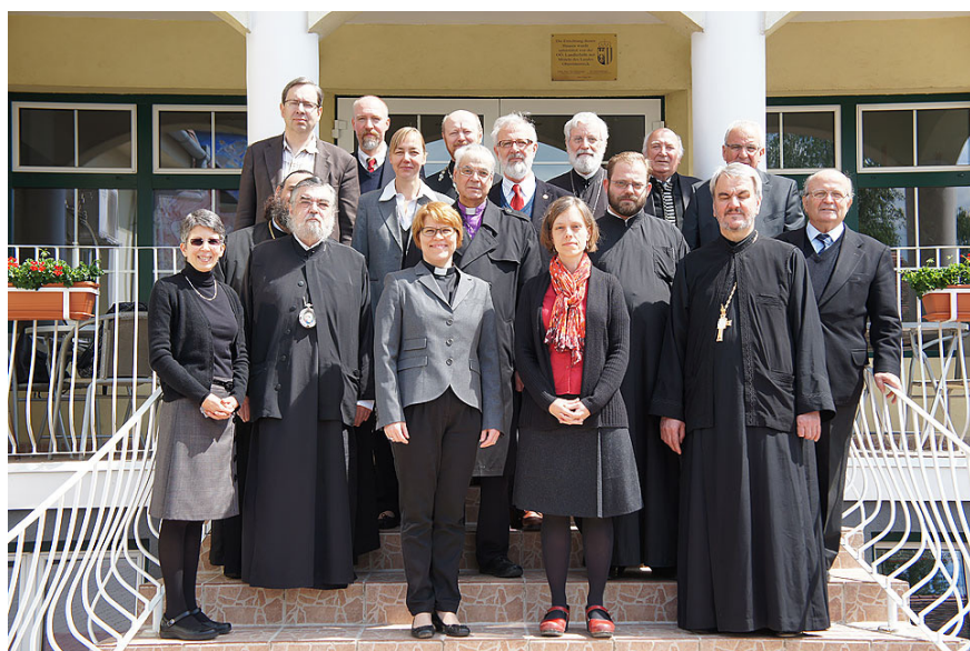
Members of the Lutheran-Orthodox Joint Commission at the preparatory meeting in Sibiu, Romania.

The LWF will host the 2014 preparatory meeting.