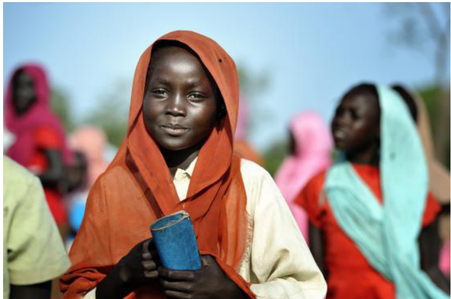
The need to provide child protection and education remains a priority in LWF's care for refugees across the world.

For Younan, the initiative by the UN High Commissioner to bring religious leaders together to talk about faith and protection "is important not only for the protection of refugees but also as a practical way of promoting inter-religious cooperation and understanding. It focuses not inwardly on us, but