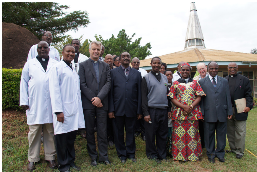
The LWF delegation meets with KCMC staff in Moshi.