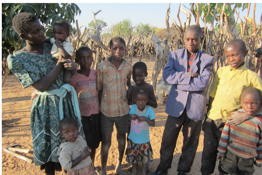
Makala's family sells paw paws to buy food after drought killed their millet crop.

The LWF assessment noted that with unemployment levels reaching 90 percent in some areas, there is a danger that elderly pensioners, who are willingly helping family members, may be exploited.