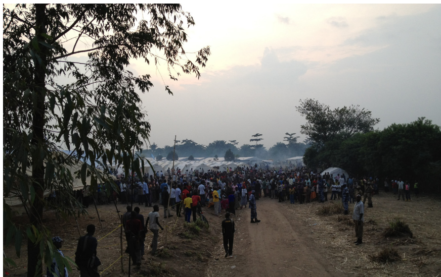
Bubukwanga refugee camp, Bundibugyo, Uganda.

After eight hours on the road together with crowds of people from Kamango, Maurita and her husband were in safety in Uganda.