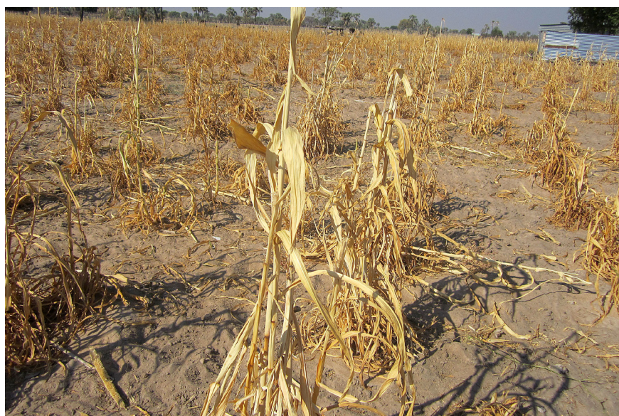
A field of dead millet crop in Omusati region, northern Namibia.

The current crisis exacerbates poverty across rural areas of the country—some with unemployment rates as high as 90 percent—and diminishes communities’ resilience to cope with disasters. From the LWF assessment it was found that coping mechanisms include alcohol consumption to reduce hunger and mitigate stress, which the