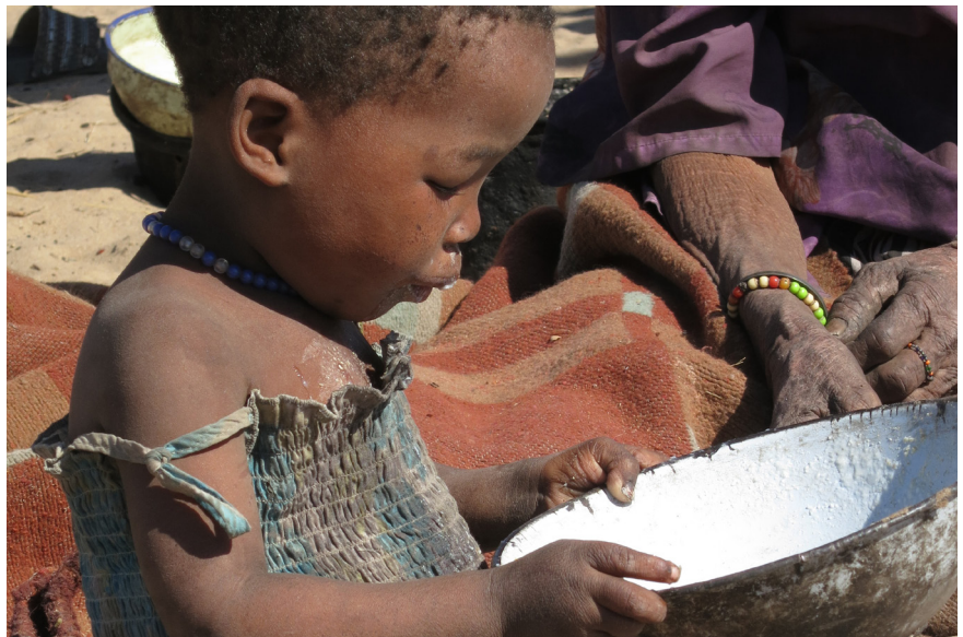
A hungry child with an empty bowl close to Ncaute village in the Kavango region.

He affirmed the important role of the LWF’s presence through member churches and DWS program work. “These are indeed strong links and connections to hear the story, to sense the danger of this drought and to feel the pain it is producing today,” he added.