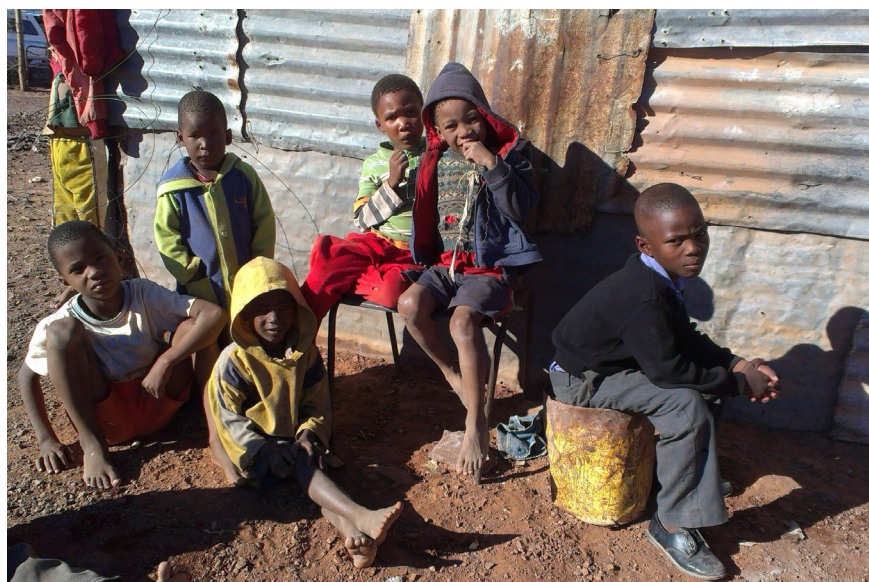
Children in Maltahohe, southern Namibia.

Up to 80 per cent of households across the country own livestock and