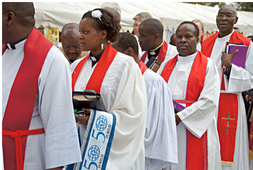
Pastors from the ELCT prepare for the procession preceding the worship service to mark the 50th anniversary of the church.