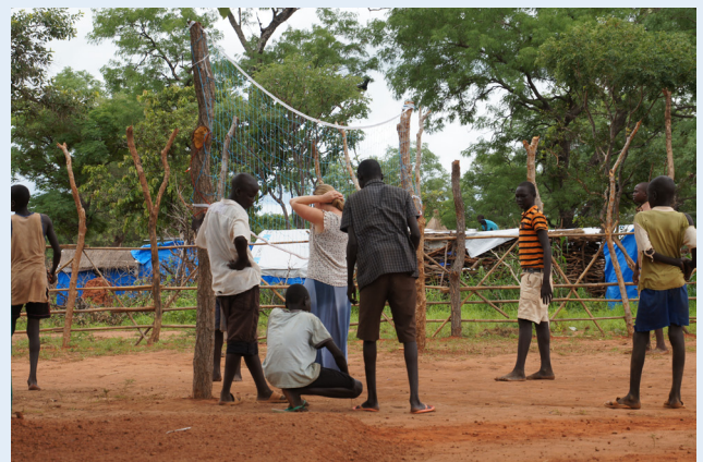
Young people playing at the Yida refugee camp. The LWF will increase the learning programs and ensure safe school environments.

Proximity to the conflict in South Kordofan State poses serious security concerns, and only basic lifesaving and emergency