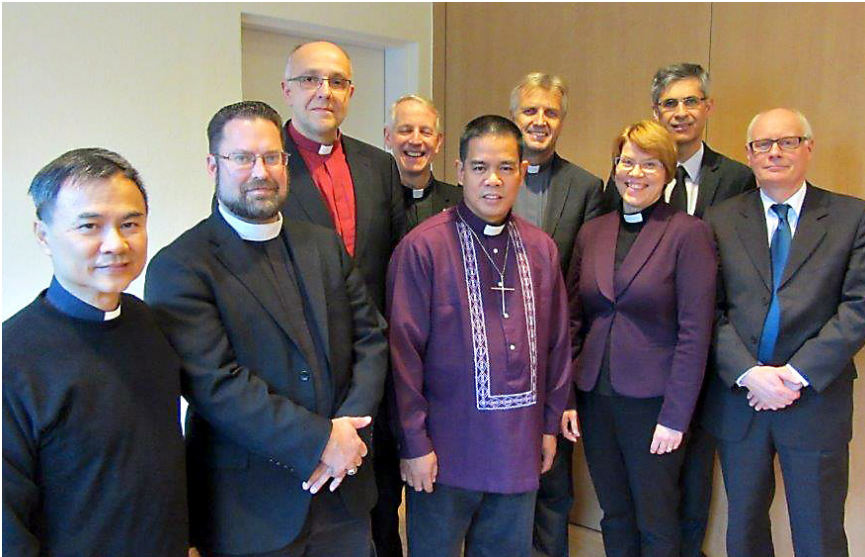
Participants at the ILC-LWF meeting in Wittenberg.

representatives of the LWF and ILC will continue to reflect on the question of dual membership.