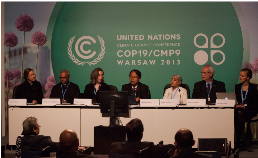
COP 19 plenary session.

agreement for all countries at COP21 in Paris, France.”