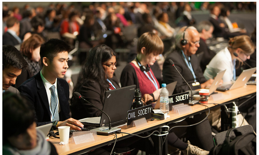
Many of the 15,000 participants at the UN climate change conference are civil society.

discuss how they can continue working together as people of faith towards COP20. The monthly day of fasting in the period leading up to COP20 is one of the initiatives in this discussion.