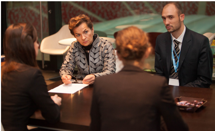
Christiana Figueres speaking with the LWF COP19 delegation.

She shared with the LWF delegation her understanding of the significance of how religions are standing together, speaking out and taking action together on climate justice. “This is not a sprint, this is a marathon,” Figueres said, and invited the interfaith movement to keep up their engagement also after COP 19 and continue putting pressure on international and national level for the sake of the climate.