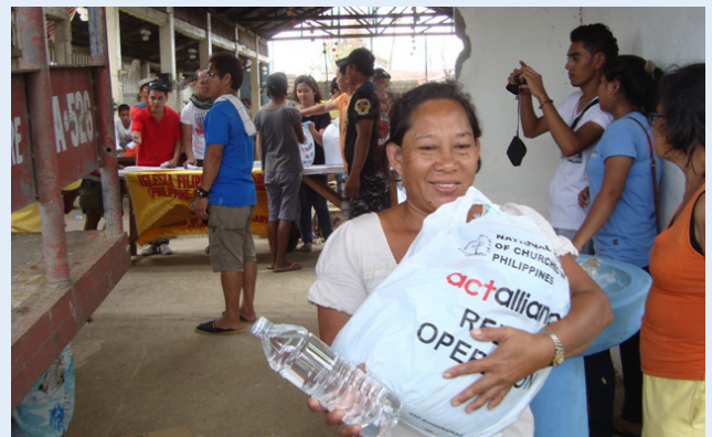
A woman cradles her package of rice, tinned fish and cooking oil. Through the NCCP, the LWF is giving priority to the poorest of the poor, female-headed households, and families with disabilities.