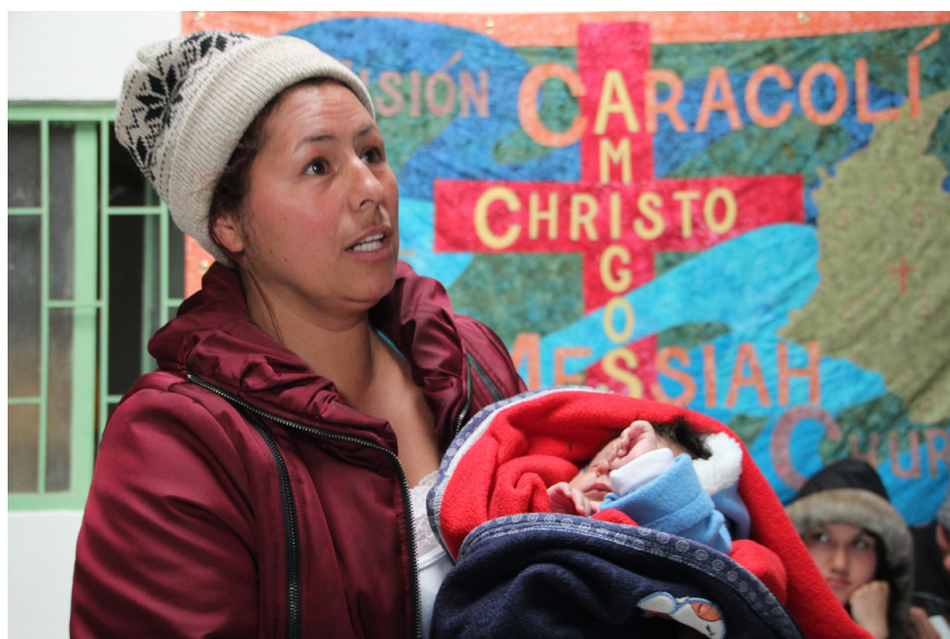
A leader of a women’s group that is part of IELCO’s diaconal work in Garacolí near Bogotá.

LWF’s presence in Colombia includes IELCO which has been a member church since 1966, and the Department for World Service country program.