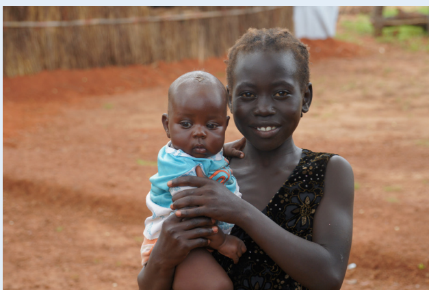
Particular attention is being given to children and young people living in households without adults.

support are provided at Yida, which was hosting around 70,000 Sudanese in early December. The South Sudanese government and the United Nations High Commissioner for Refugees began relocating Yida’s refugee population to a new refugee camp, Ajuong Thok , which had more than 6,500 people by December.