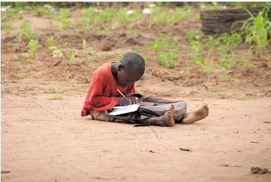
LWF supports school-age children at the Yida refugee camp in Unity State, South Sudan.

“The LWF has been working with education and support for children in some of the world’s most precarious conflict zones for many years. We are grateful for the opportunity offered