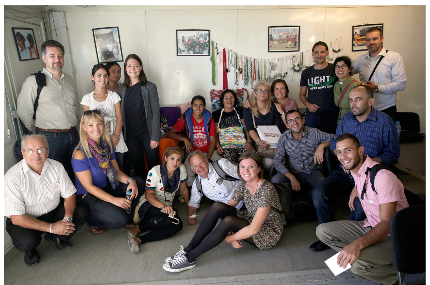
Church of Sweden delegation visiting income generating projects in Southern Mitrovica/a, Kosovo.

Roma has been an advocacy focus for many years. The LWF Assembly in Stuttgart 2010 passed a resolution calling upon member churches to “contribute to the empowerment and integration of