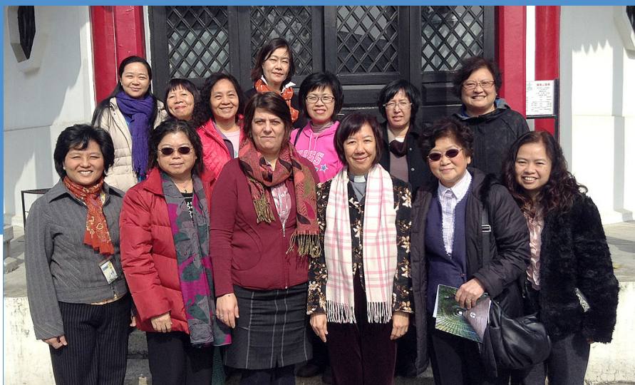
The North East Asian Lutheran Communion women theologians together with the LWF Secretary for Women in Church and Society.

Scarred by Rape but Spreading Hope among Women Refugees ..... 15