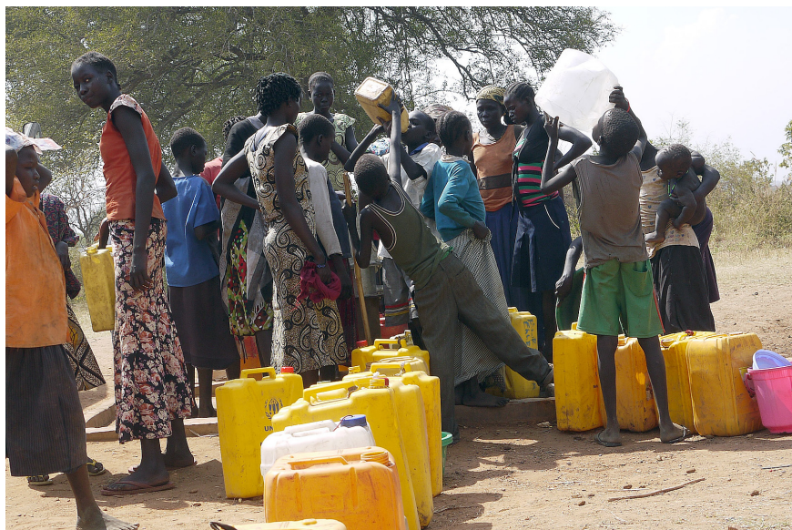
Borehole rehabilitated by LWF in Nyumanzi refugee settlement, Adjumani district, northern Uganda.

where more than 43,000 refugees from South Sudan are currently residing. It is afternoon and dust hangs in the air. There has been no rain for months and Mesiku joins the many women from the local community who