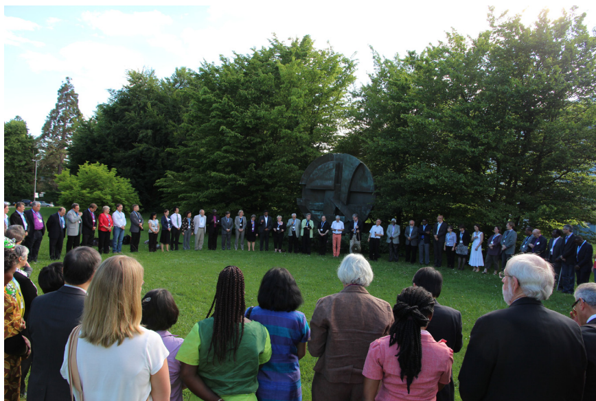
Council 2013 evening prayer

Accompaniment visits have been scheduled with the Ethiopian Evangelical Church Mekane Yesus and the Church of Sweden in the course of the coming months. The LWF Communion Office will offer an account of the accompaniment process to the LWF Council in June this year.