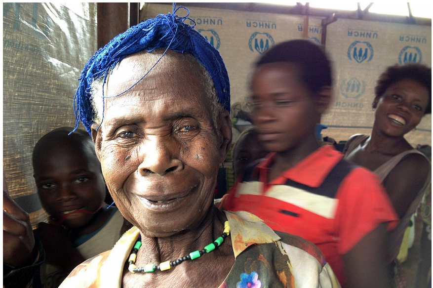
Most DRC refugees in camps southwestern Uganda are women and children.

The LWF works with UNHCR and its partners in the global churches’