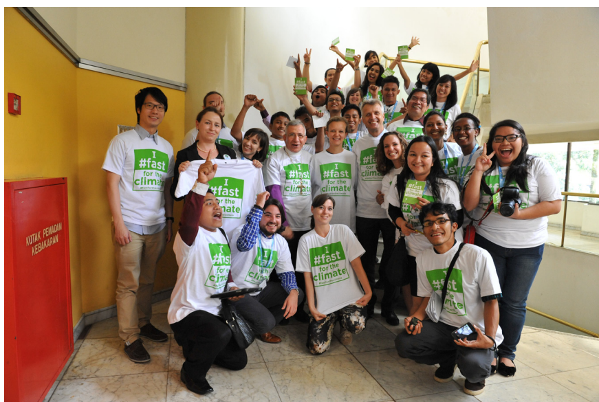
Youth were among those at Council 2014 who showed solidarity with people affected by climate change by joining the #fastfortheclimate.

LWF has been advocating for climate justice on a global level since the LWF Assembly 2010 in Stuttgart, Germany. Bishop Tamas Fabiny, LWF vice-president for Central Eastern Europe, called upon governments and leaders to act for climate justice. “Being citizens of this world we need to speak about about their climate change politics”. LWF would not stop advocating for climate justice. LWF president Bishop Munib A. Younan closed the fasting action with a prayer, recalling the spiritual dimension of fasting.