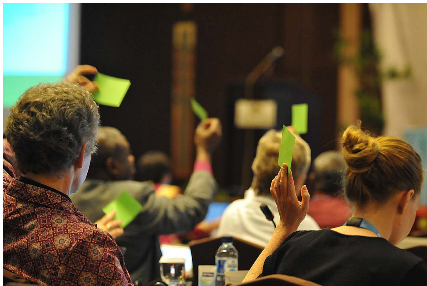
Council members vote on LWF decisions.

The Council took a further step regarding the dialogue with the Pentecostal churches. The dialogue process with the association of the Assemblies of God will have the theme “The spirit of the Lord is upon me.” The Council appointed members of the dialogue commission.