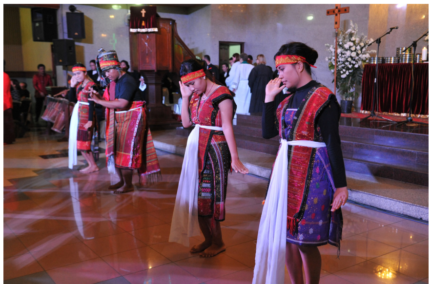
A Batak group performs a traditional dance showing the confession of sins.

The opening service which was held mainly in English had many elements of these traditional roots, most visible in a traditional Batak dancing group which led the opening procession and performed a Tortor Batak, a contextual dance which in this case told about the confession and the forgiveness of sins.