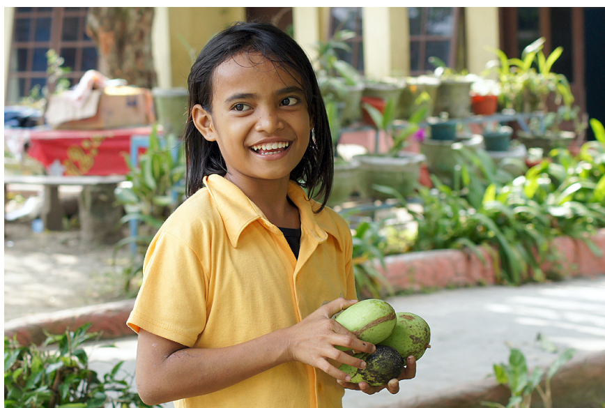
Climbing Mango trees for some extra sweets is part of a childhood in the HKBP orphanage in Pematang Siantar.

GKPS is also running one of the oldest LWF projects in the country.