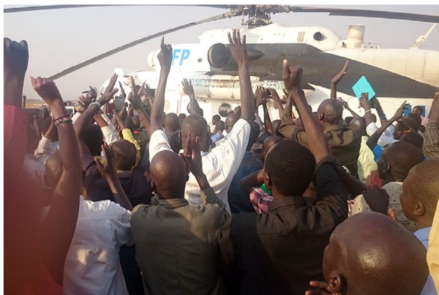
The returning LWF staff were welcomed by a crowd at Juba airport.