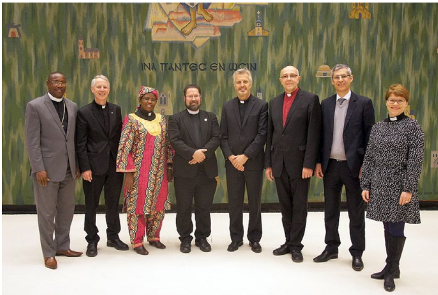
LWF and ILC representatives at the January 2015 meeting in Geneva.

While the LWF and the ILC are at different stages in planning for the 500 th anniversary of the Reformation in 2017, the ILC expressed