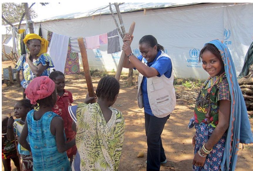
LWF team leader in Cameroon helping women and children prepare food.

The refugees from CAR who sought asylum in Cameroon settled mainly in the villages in the East and Adamawa