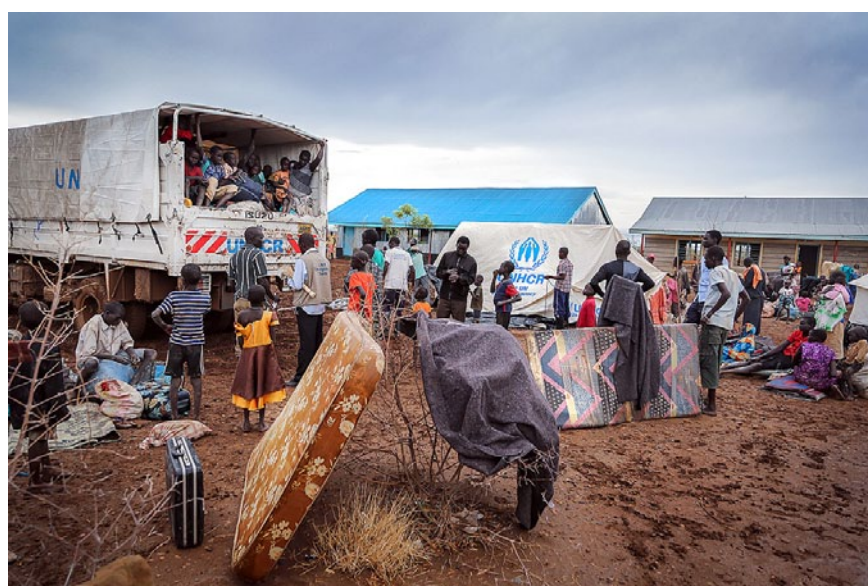
UNHCR and LWF response to South Sudanese refugees in Maban refugee camp.

In discussion with CWS members on 22 January at the UNHCR, Mr Okoth-Obbo talked about the refugee situation worldwide with a special focus on Africa, where LWF is working in 11 countries, partnering with UNHCR in seven of them. Two of them, the Central African Republic and South Sudan, have been classified as most severe, large-scale humanitarian crises (Level 3-emergencies) by the UN. “A larger proportion of the displacements in Africa today are internally displaced persons (IDPs),” Mr Okoth-Obbo said, citing the example of South Sudan which has seen more