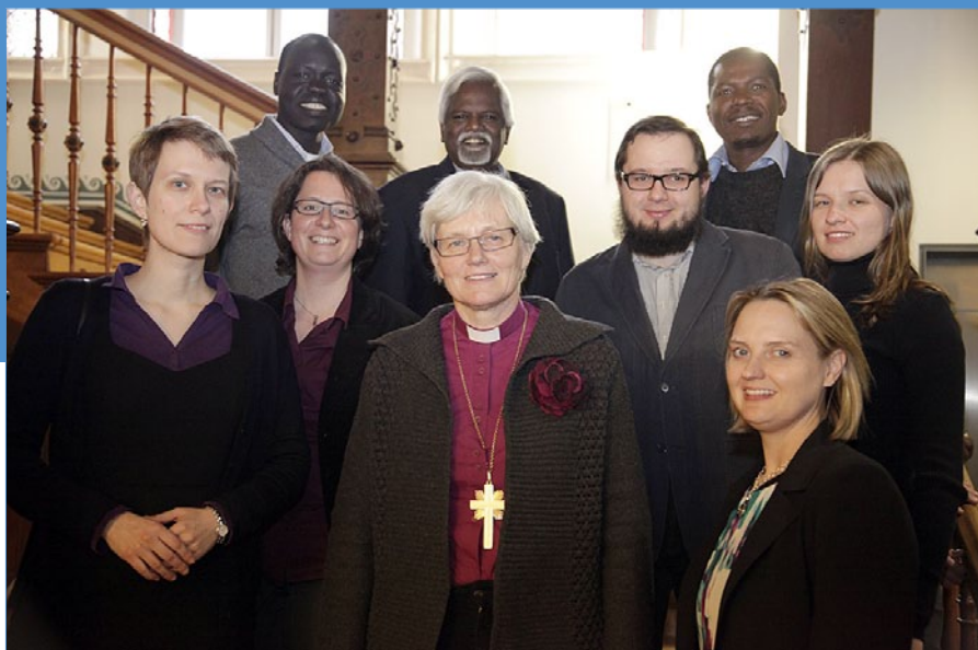
LWF member church representatives and staff at the first meeting of the LWF study group on Lutheran engagement in public space, in Stuttgart, Germany.

LWF to Take Over Camp Management of Mbera, Mauritania ..... 15