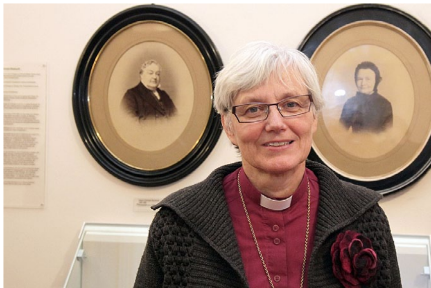
Church of Sweden Archbishop Dr Antje Jackelén.

“How might we be a more prophetic Lutheran/Christian witness amidst the cacophony of religious voices in our public square? How might we, as Lutherans, contribute in partnership with others to building healthy societ-