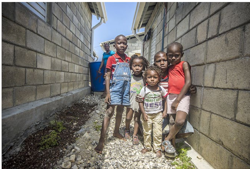
Tiny survivors of the 2010 Haitian earthquake gather outside the Model Resettlement Village in Gressier.

The Model Resettlement Village is situated in Gressier, just west of