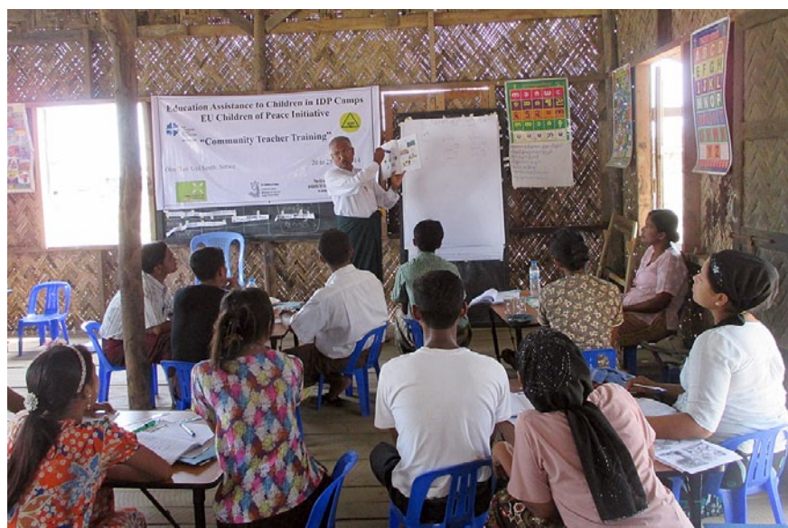
Community-school teacher training for the Children of Peace project in Sittwe.