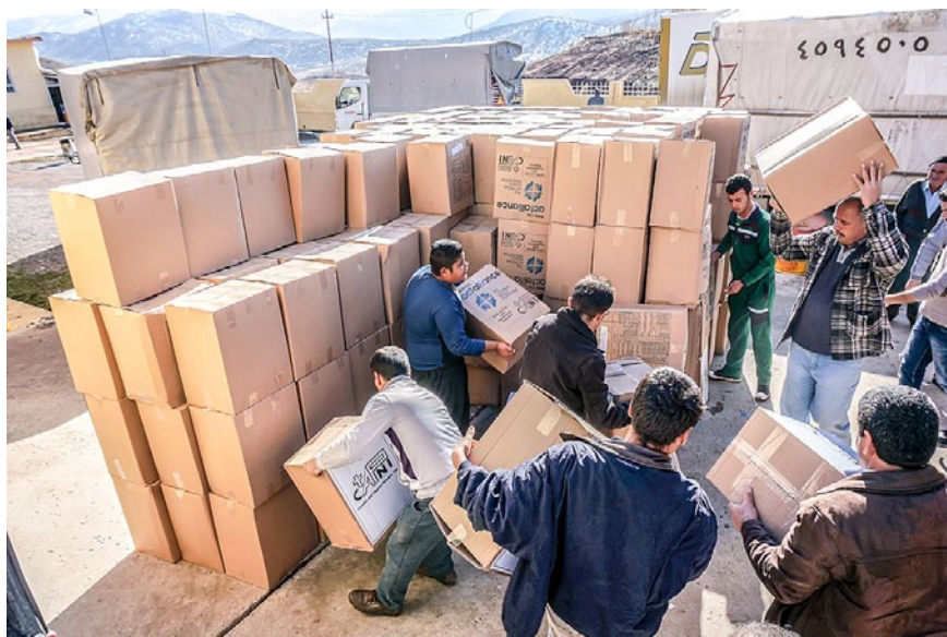
Distribution of winter clothing to refugees in Khanki camp, Dohuk.

We also did rehabilitation work in public schools, where refugees had been living during the summer break. In addition we provide counseling and community-based psycho-social support together with the Kirkuk Center for Torture Victims and the Jiyan foundation. Until now we have spent about 1 million USD for the response in Iraq, supported by many members of the ACT Alliance.