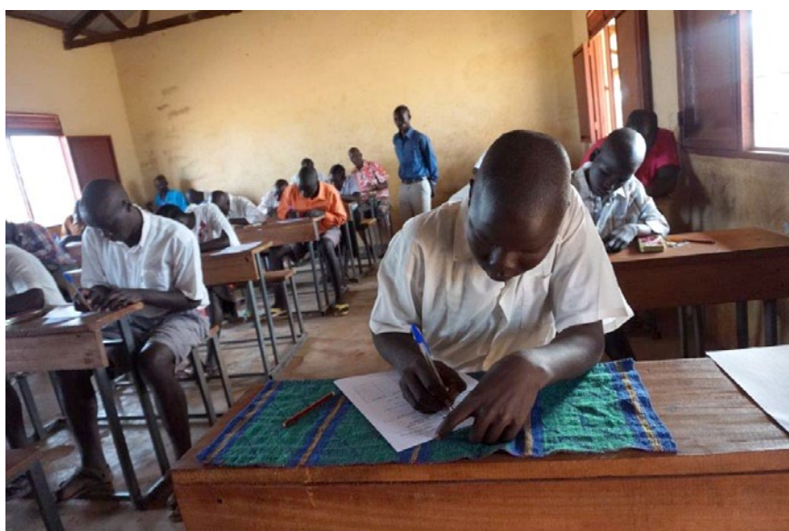
Primary school students sit their final examination at Napata school in Ajuong Thok refugee camp, South Sudan.

The war in South Kordofan, Sudan has resumed with more intensity. Aerial bombings have destroyed basic facilities including schools and hospitals in South Kordofan, Sudan. “The result is an increased influx of refugees to Yida settlement and Ajuong Thok Refugee Camp in South Sudan,” says