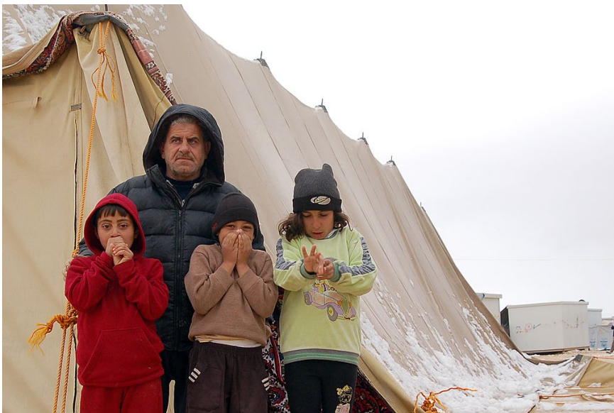
A street leader with his children in front of a half collapsed tent which is used as a Mosque.

Pfattner visited Za'atari camp the day after the storm where LWF implements a number of projects in a location known as the “Peace Oasis”. “It is also very difficult for the refugees in the camps to cope” he says. “Several tents were blown away and numerous others