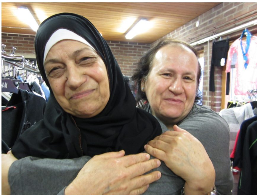
Different faiths and good neighbors in Angered, Sweden.

Portraying a Samaritan in a positive light would have come as a shock to Jesus' audience. Read the text slowly. Try to pretend that you are a member of the majority population and feel the reaction among the people listening to Jesus.