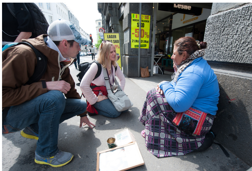
In dialogue with a person asking for support.

Initially, it seems as though the third definition contradicts the first one. At the same time, the first definition is understood as an objective statement, whereas the second very much describes a subjective experience. The third definition could indicate that status can differ from person to person; the first seems to indicate that we as persons are all equal in our worthiness.