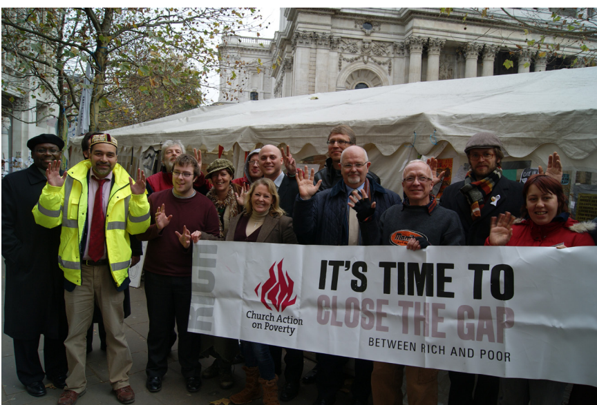
Church leaders express support for protesters against austerity