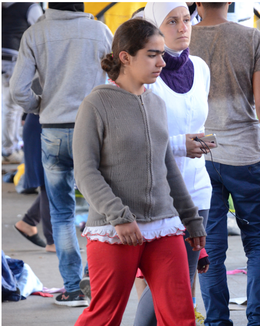
Migrants in Kletín Station, Budapest.

Before they die in Moab, the sons marry two local girls, Ruth and Oprah. Following the death of their husbands, they remain with their mother-in-law, Naomi. When Naomi decides to go back to Bethlehem. Oprah heeds Naomi's advice and goes home to her