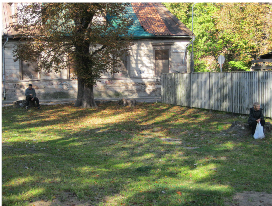
Work migration from Latvia leaves behind abandoned homes and the older generation.

Allow each participant in the group to speak about his or her experiences. If there is only time for two or three people to tell their stories at one session, continue next time. There’s no need to rush. It is important to hear each participant’s story. It is critical that participants speak about their own personal experiences, not offer the official media version regarding austerity. For this to happen there needs to be trust among the group members. There may be hurtful experiences to talk about. Perhaps a family member has had to travel to another country to earn a living. Or maybe someone has had to sacrifice their flat because of debts. After stories have been shared, other group members may ask questions without getting in a discussion or proposing solutions to questions that haven’t been asked. It is possible to film the stories and include the footage as a part of a wider film project.