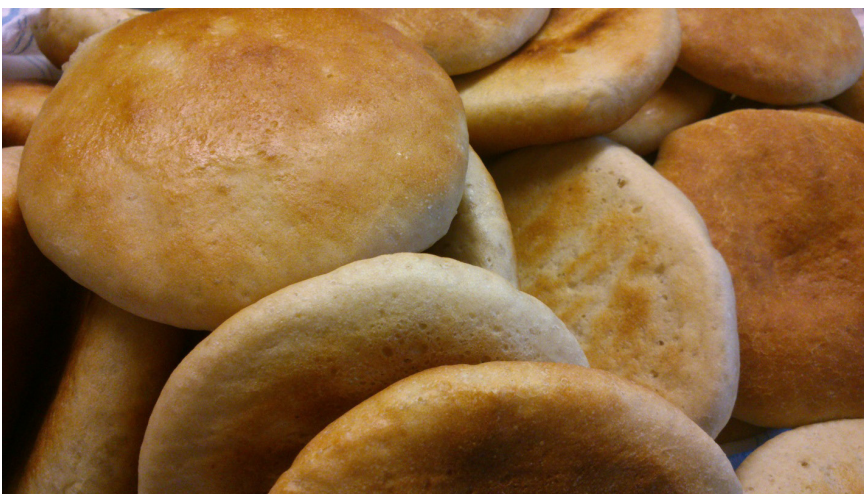
Shared bread.

Then Jesus directed them to have all the people sit down in groups on the green grass. So they sat down in groups of hundreds and fifties. Taking the five loaves and the two fish and looking up to heaven, he gave thanks and broke the loaves. Then he gave them to his disciples to distribute to the people. He also divided the two fish among them all. They all ate and were satisfied, and the disciples picked up twelve basketfuls of broken pieces of bread and fish. The number of the men who had eaten was five thousand.