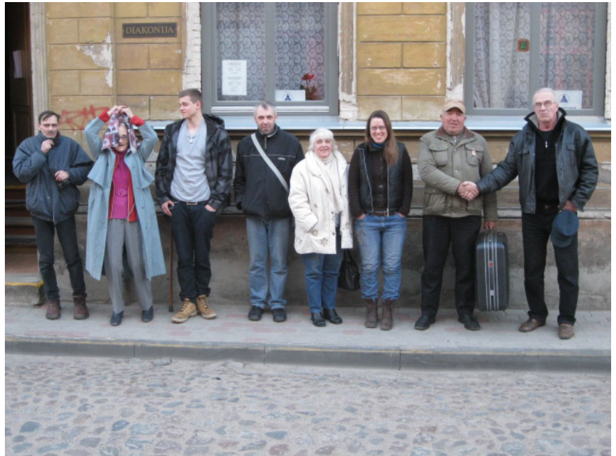
The group "Talks about the Bible and life" at The Congregation of the Cross, Liepaja, Latvia.

Make a modern film version of the parable of the unmerciful servant.