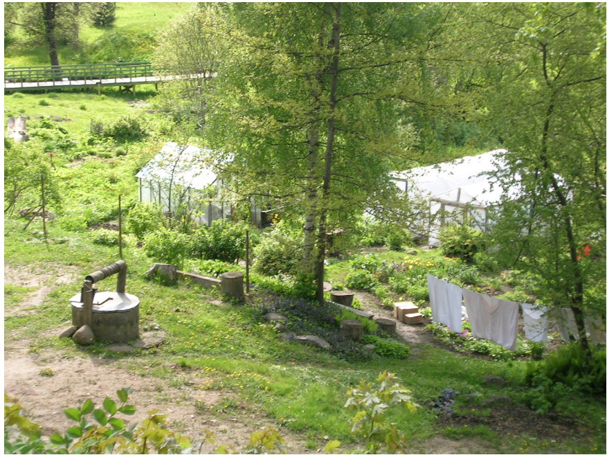
Village scene in Latvia.

What is the background of this text? The formative event in the history of Israel was their release from slavery. The reason for this liberation was not primarily on the grounds of religion. The Israelites were slaves, yes – and