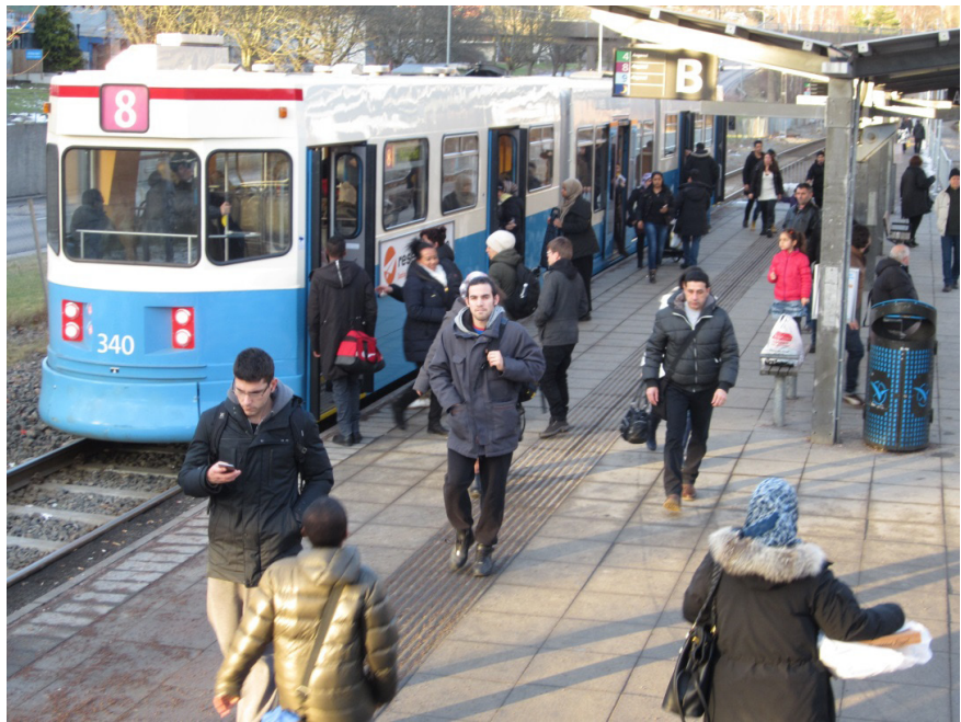
Put on your “Jesus glasses”!