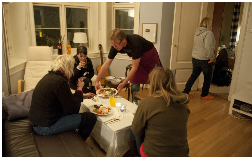
Sharing a meal at the Women's Night Shelter in Oslo.

We are challenged on how we value people: through wealth, intellect, education, position, power, passport or inheritance, etc. Jesus compels us to look again at how we go about judging the value and dignity of different persons. As long as we can rate people differently, according to skills, education, wealth, and so on, we will