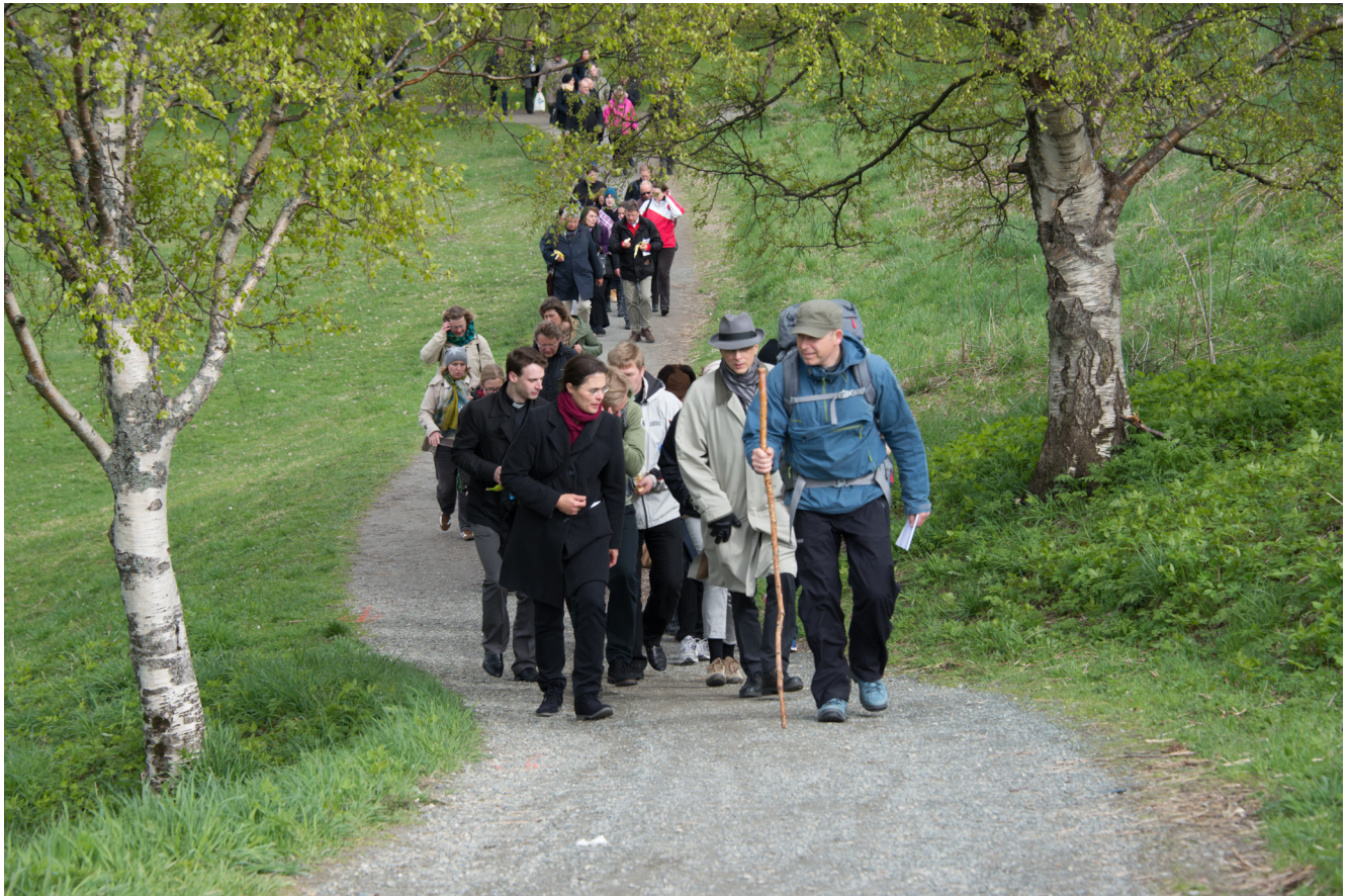
Delegates of the Trondheim Church Leadership Consultation make a 'Climate Justice Pilgrimage' from the Trondheim Free Church to Nidaros Cathedral, Norway, May 13, 2015.