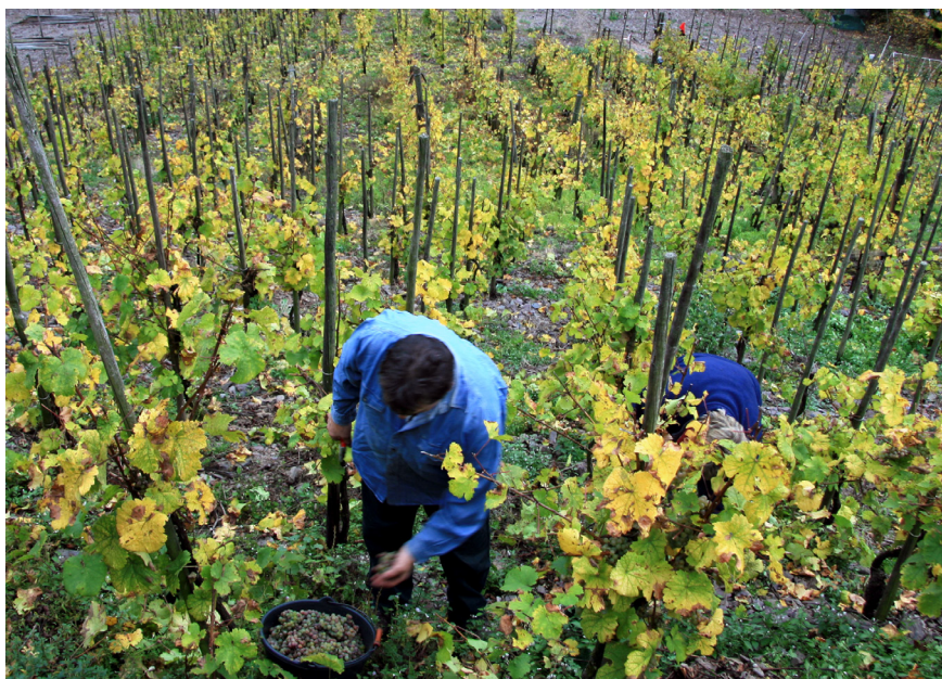
Wine harvest in Moselle.

Work is an essential form of participation in society. Those who do not get work are excluded from society.