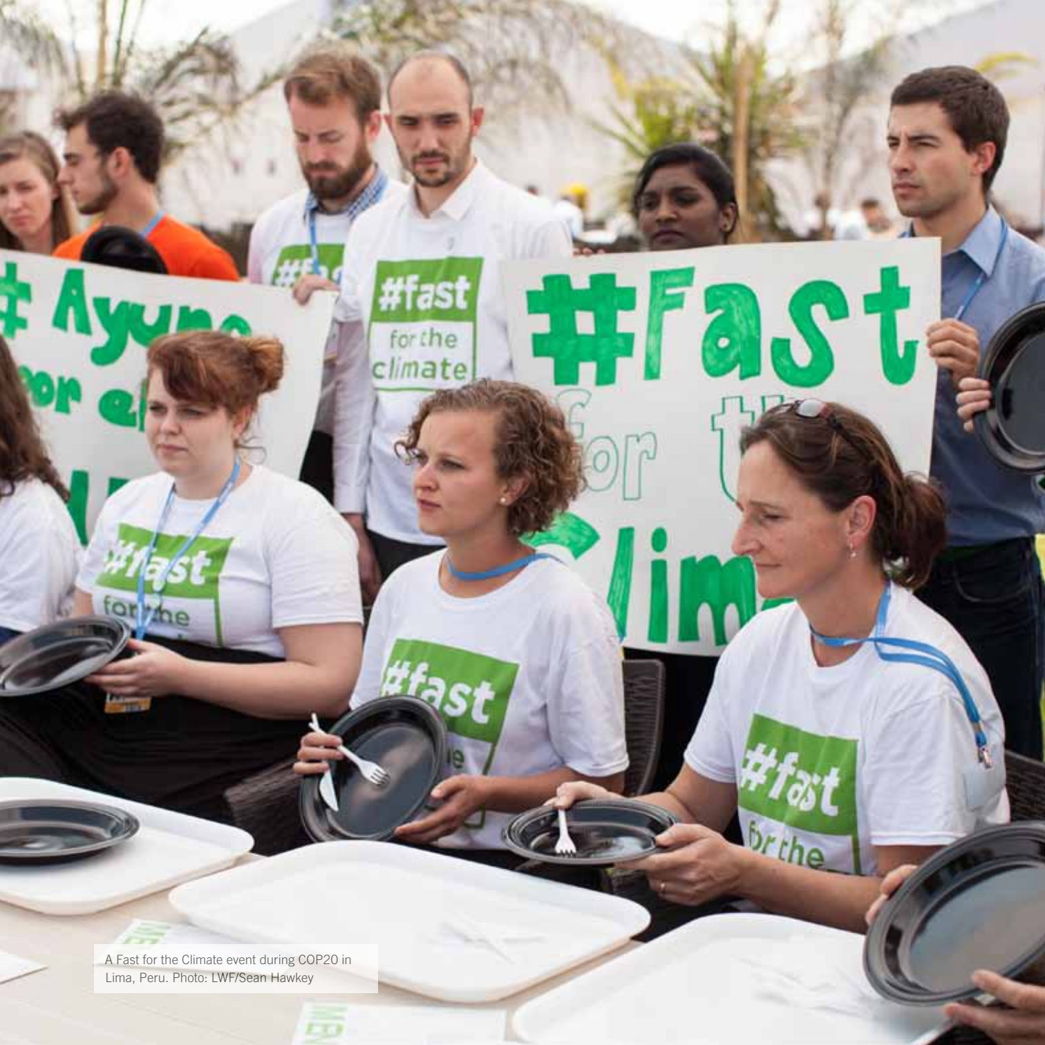
A Fast for the Climate event during COP20 in Lima, Peru.