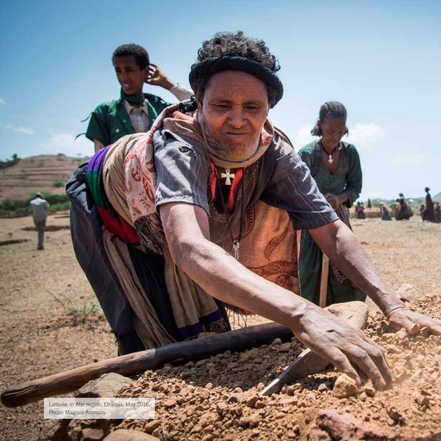
Lalibela, in Afar region, Ethiopia, May 2016.