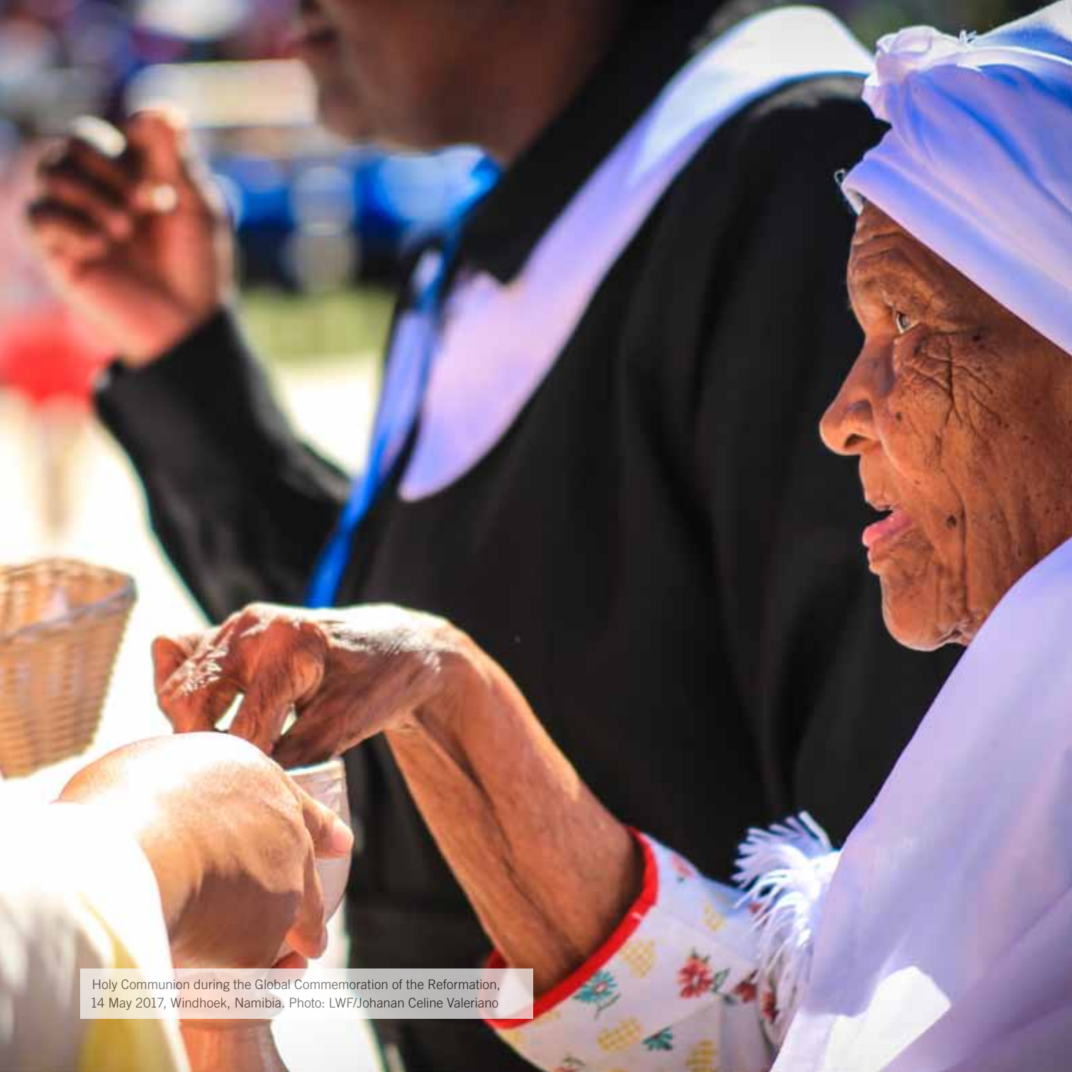
Holy Communion during the Global Commemoration of the Reformation, 14 May 2017, Windhoek, Namibia.