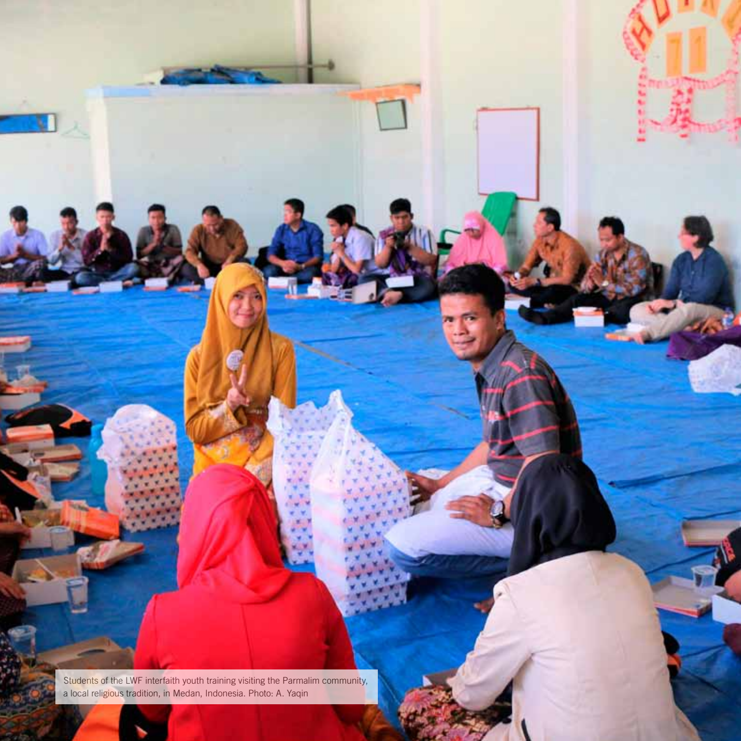
Students of the LWF interfaith youth training visiting the Parmalim community, a local religious tradition, in Medan, Indonesia.