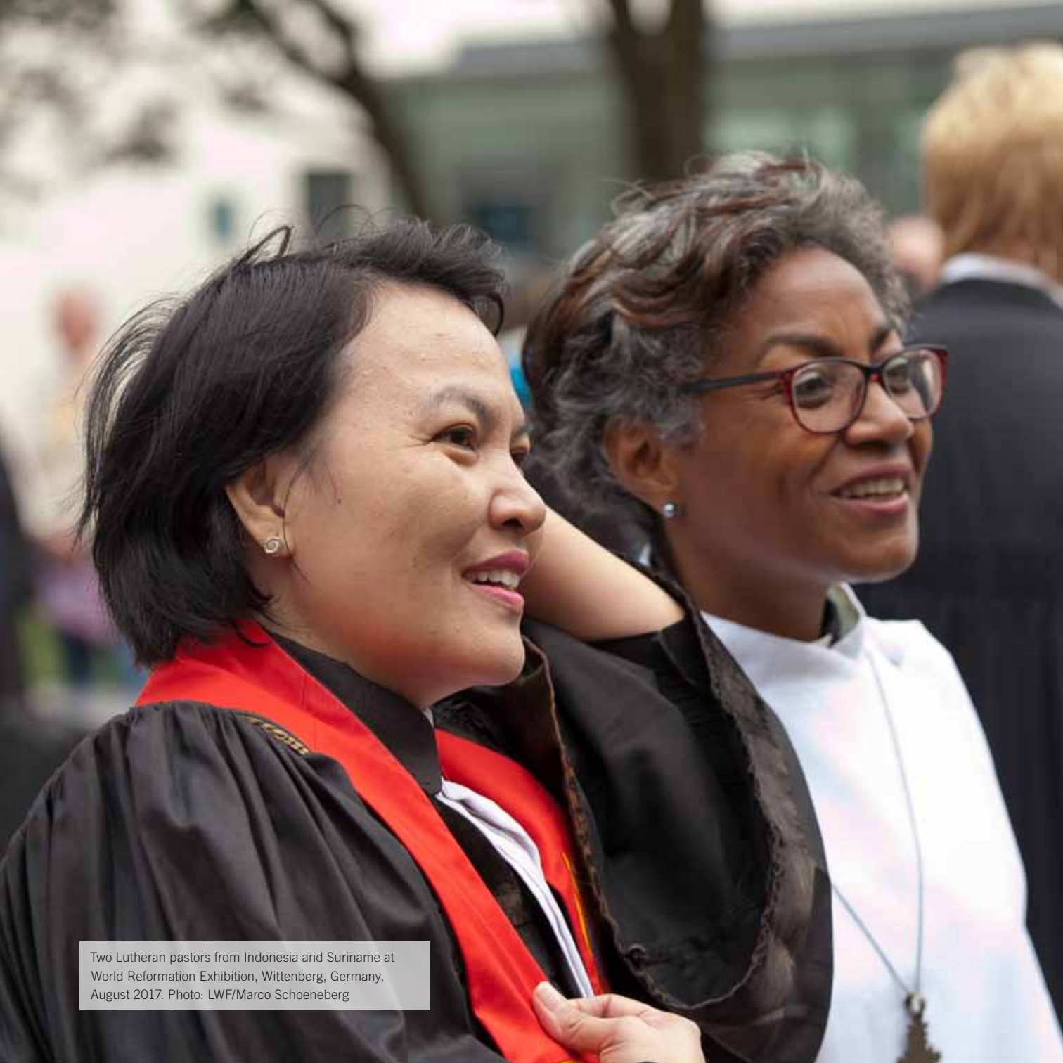
Two Lutheran pastors from Indonesia and Suriname at World Reformation Exhibition, Wittenberg, Germany, August 2017.