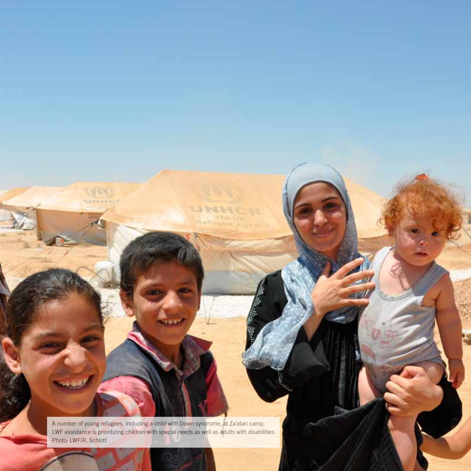
A number of young refugees, including a child with Down syndrome, at Za'atari camp. LWF assistance is prioritizing children with special needs as well as adults with disabilities.