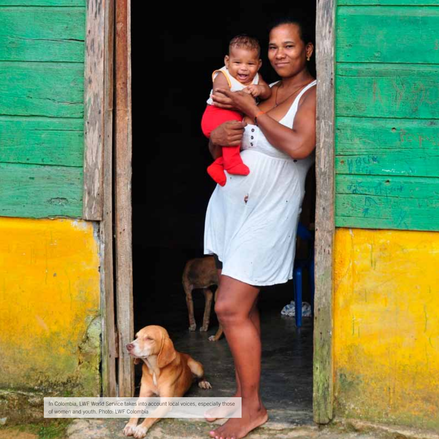
In Colombia, LWF World Service takes into account local voices, especially those of women and youth.