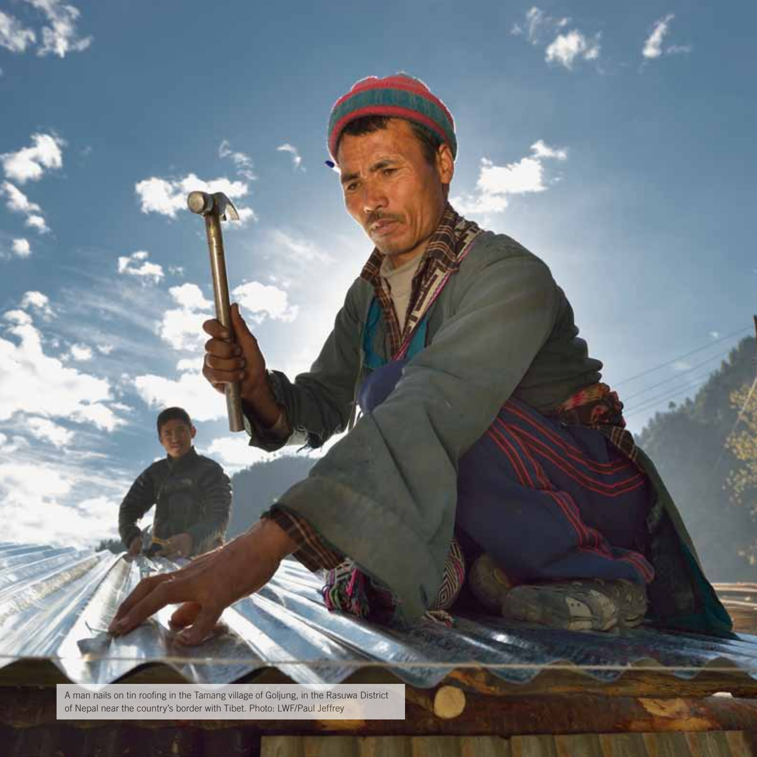
A man nails on tin roofing in the Tamang village of Goljung, in the Rasuwa District of Nepal near the country's border with Tibet.