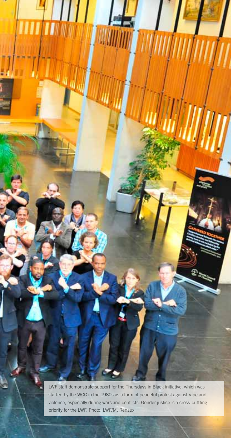
LWF staff demonstrate support for the Thursdays in Black initiative, which was started by the WCC in the 1980s as a form of peaceful protest against rape and violence, especially during wars and conflicts. Gender justice is a cross-cutting priority for the LWF.