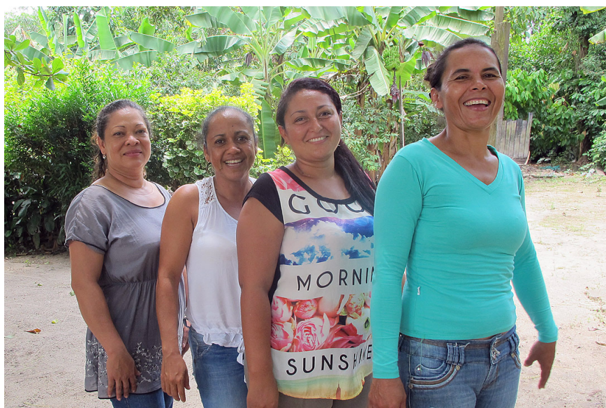
Colombian women have learnt how to demand their human rights, through AMAR.