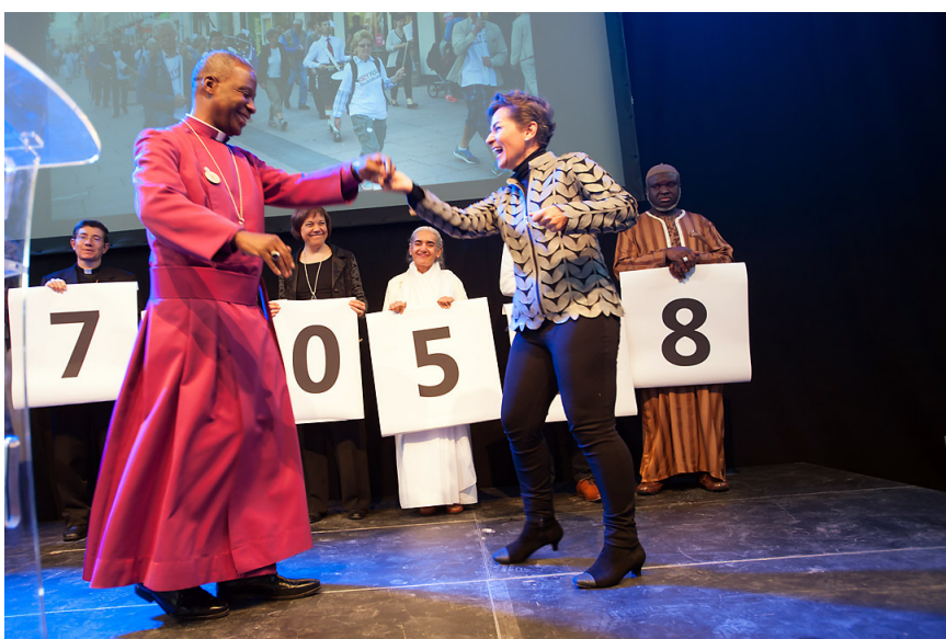
Christiana Figueres, Executive Secretary of the United Nations Framework Convention on Climate Change, dances with Archbishop Thabo Makgoba of South Africa to celebrate some 1.8 million signatures on an interfaith petition for climate justice during the COP21 climate summit in Paris, France.

"We appeal to governments and world leaders gathering here in Paris to look into their hearts and heed the clamor for change and transformation and help build a world that is safe, peaceful, and sustainable for all humankind," said Saño.