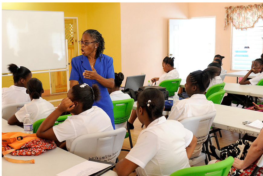
Women’s centre in Kingston, Jamaica, offering education to young mothers so they can continue their education after giving birth.

“We want to bring this to a public level. It should be part of an agenda