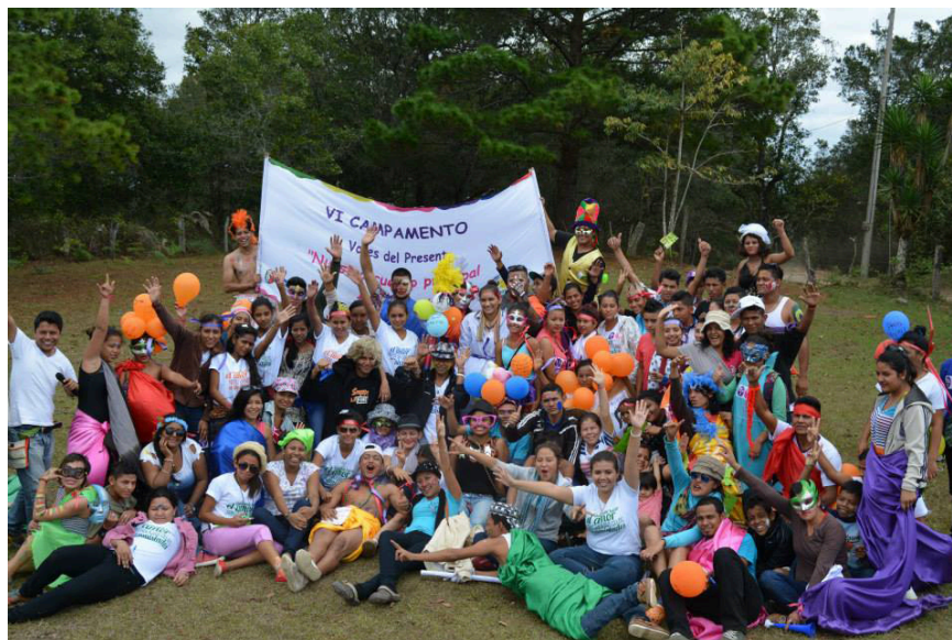
Camp of the “Networks in motion” project.

“In my family there are several men and when they make a macho comment I try to tell them that this is not right, although it is difficult. I am struggling to change their attitude,” she says.