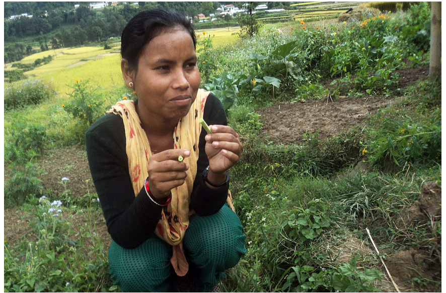
A Dalit woman in Nepal. Implementing the Discrimination and Untouchability Act of 2011 which abolishes caste discrimination is a major human rights challenge in Nepal.

"The way in which the LWF together with its partners have worked on the UPR of Myanmar and Nepal demonstrates how international instruments – when strategically coordinated from local to global – can deliver tangible results on the ground, and contribute to an improvement of human rights and good relations between state and civil society," Ojulu concluded