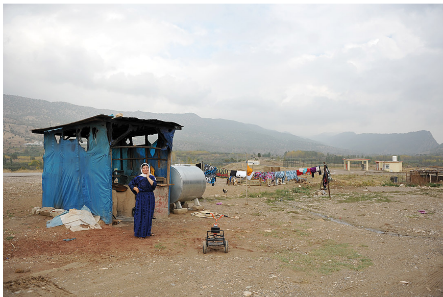
The LWF is helping camp residents prepare for winter in northern Iraq.

“We don’t know how to continue like this”, Theriakos says. “I am an old man, I want to stay, but the young people want to leave.” While he speaks, images of immigrants crossing borders in Europe can be seen on TV in the small room, where ten people have assembled around an improvised dinner table.