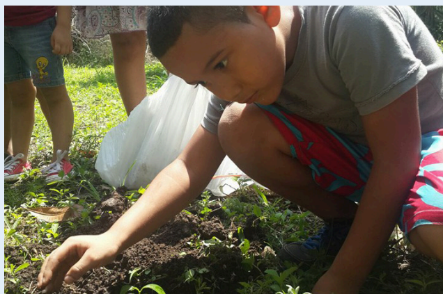
A child at Casa Abierta in Carpio, San José, plants one of the first trees to mark ILCO's observance of the 500th anniversary of the Reformation.

For ILCO and its 1,400 members, the cross remains a sign of the infinite love of God. "Even in situations where love, compassion