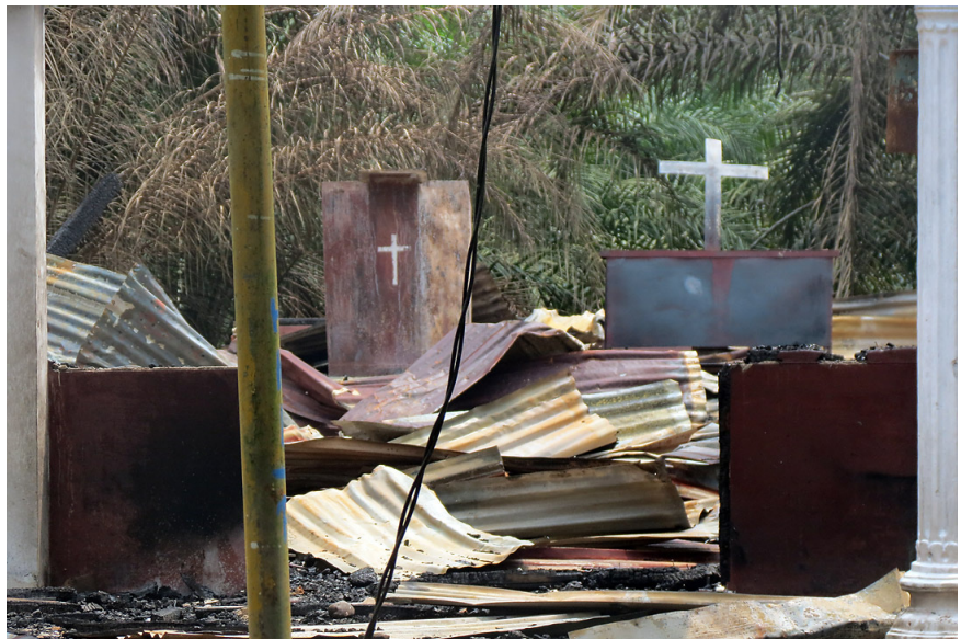
Two crucifixes remain upright in the remnants of an Indonesian church burned in October 2015.

Churches exist in areas where Christians are the majority. “How will