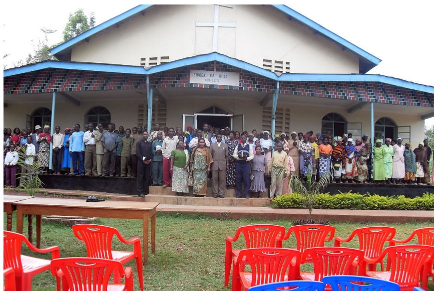
ELCT's HIV and AIDS awareness building efforts includes seminars for married couples.

Tanzania is one of the sub-Saharan African countries that has been hard-