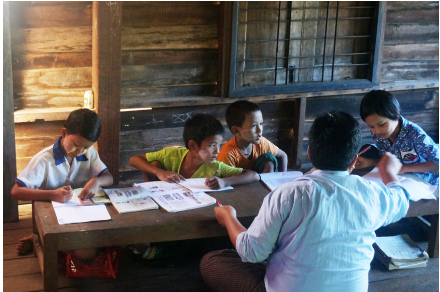
Thanks to the work of the Lutheran churches in Myanmar, children from marginalized communities can go to school and aspire to a brighter future.

The four LWF member churches also include the Mara Evangelical Lutheran Church and the Evangelical Lutheran Church in Myanmar (Lutheran Bethlehem Church), which altogether have around 28,000 members.