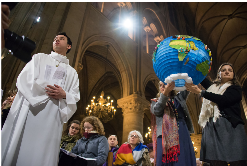
Youth hold symbols of creation during an ecumenical celebration at the Cathedral of Notre Dame de Paris during the COP 21 climate talks taking place in nearby Le Bourget, 3 December 2015