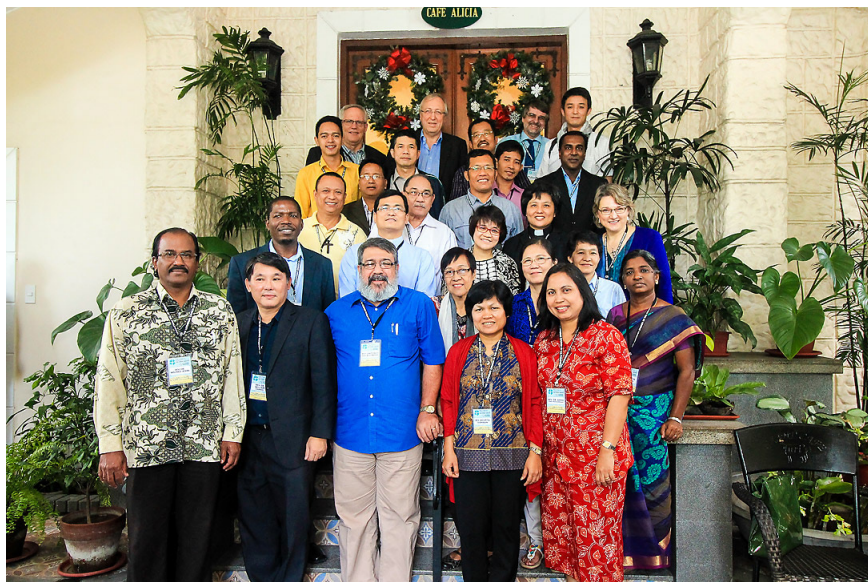
Asian church leaders gathered to discuss differences and commonalities across Lutheran churches of the Asia region.

for mutuality and cooperation. He pointed to six vital areas that must be considered when re-thinking Asian identity – communion identity, confessional identity, liturgical identity, Refor-