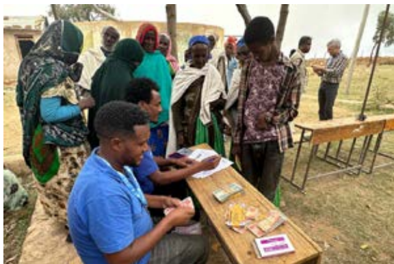
A cash distribution point operating in Sewha Saesie, Eastern Tigray, Ethiopia.