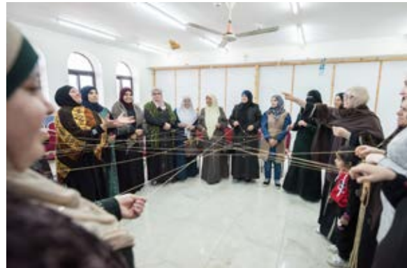
Women gather at a psychosocial support session for Syrian refugee mothers and Jordanian host communities in Al-Mazar, Jordan.

Moreover, we facilitate local efforts to enhance inclusive, protective, and non-discriminatory policies, formal and customary laws, structures, and systems, with specific emphasis on gender and inclusion. We also collaborate with others to find and implement durable solutions for individuals, families and communities .