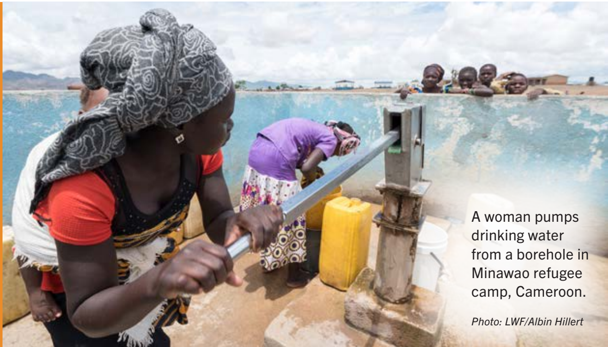
A woman pumps drinking water from a borehole in Minawao refugee camp, Cameroon.